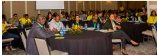
Newly elected ICAC President, Anthony Pierre, addresses delegates during the closing session of the ICAC Conference.