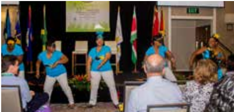
Members of the Bahamas Institute of Chartered Accountants performing during the 2018 ICAC Conference promotion.