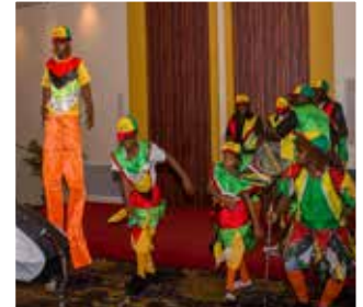
Traditional Guyanese cultural presentation during the welcome reception.