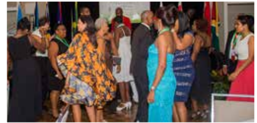
Delegates and spouses dancing to the rhythms during the President's Dinner.