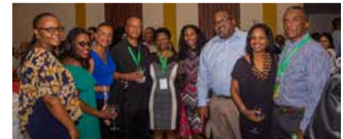
Delegates from the Eastern Caribbean pause from the festivities for a photo during the welcome reception held at the Pegasus Guyana Hotel.