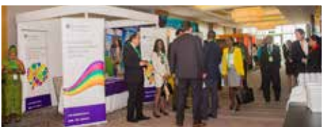
Delegates networking during the Conference.