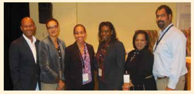
Members of BICA's Executive Council at The IBFS Conference in Freeport, Grand Bahama.

On February 5-8, 2015, The Bahamas Financial Services Board held its annual International Business and Finance Summit, under the theme "Creating a New Legacy". The summit which was held at The Grand Lucayan Resort in Freeport, Grand Bahama, was attended by members of BICA's Executive Council, who were kept abreast of developments within the financial services industry.