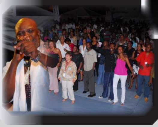
Delegates partying at the Trini-Style carnival fete.