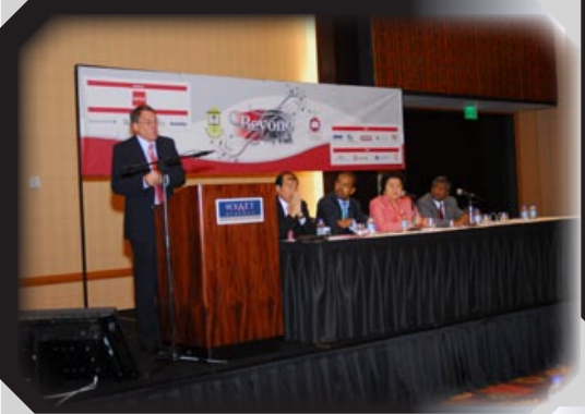
Power Panel Discussion on Financial Services in the Caribbean - Consolidation and Foreign Ownership.

Speakers who presented on the topic Improving Performance and Operational Efficiency in the Regional Energy Sector'.